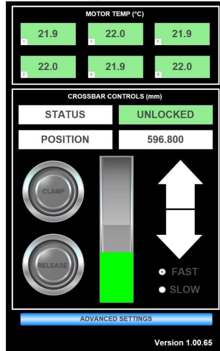
Crossbar Keypad Interface