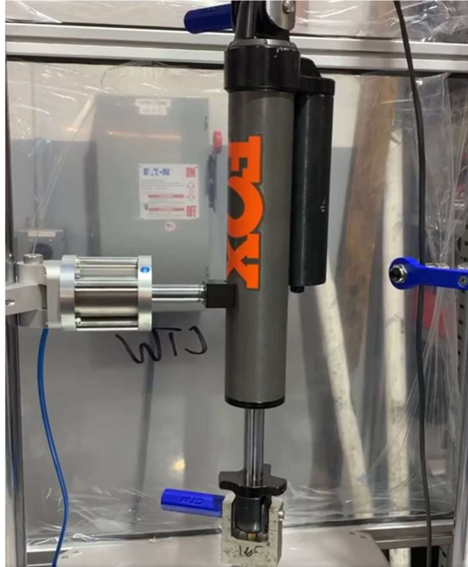
Analog Output controlled Side Loading device

Side Loading Addition - Apply constant force to the damper body (nonmoving) controlled thru CTW Probe software command using pneumatic cylinder. Available up to 225 lbs. / 1,000 N. The force is set before each Test or before each speed so that a constant force can be applied or changed or even removed per speed.