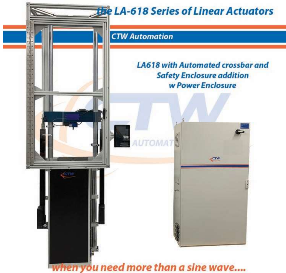
LA613/618 - shown with optional enclosure / cage

the LA613 by CTW Automation - (6) Motor (13) Inches of travel