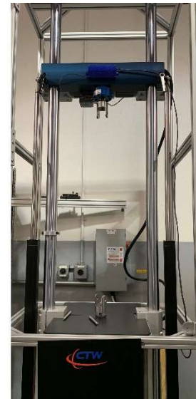
Complete LA with Automated crossbar and Enclosure showing full system and 1000 mm range of travel