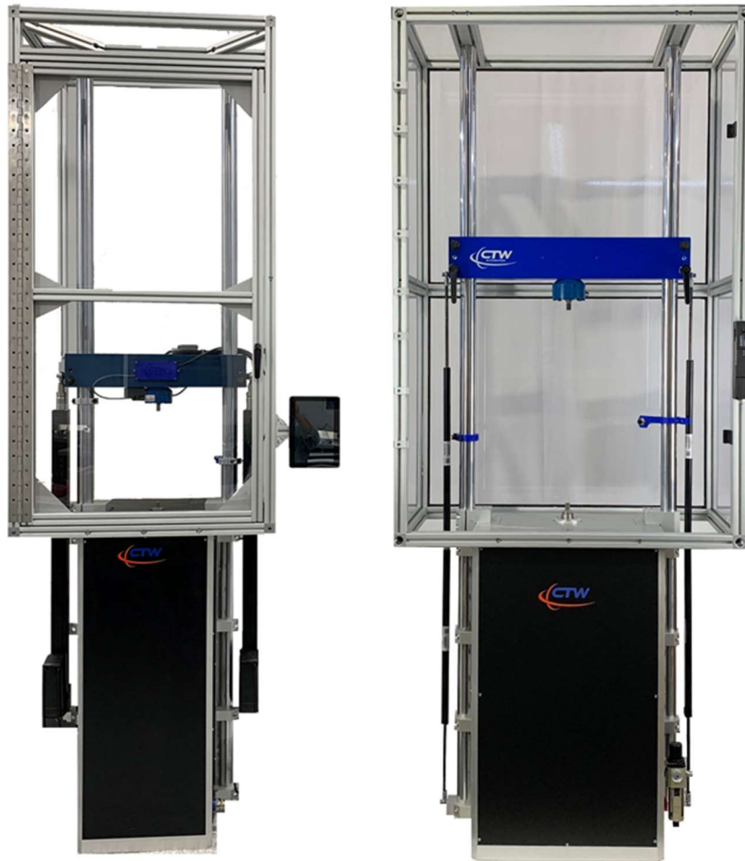
Fully Automated Crossbar LA

CE compliance – This adds a complete power-off safety circuit to be used with Enclosure option. This CE option prevents the flow of power to the machine unless the CE circuit / door lock is satisfied. - Requires the addition of enclosure option.